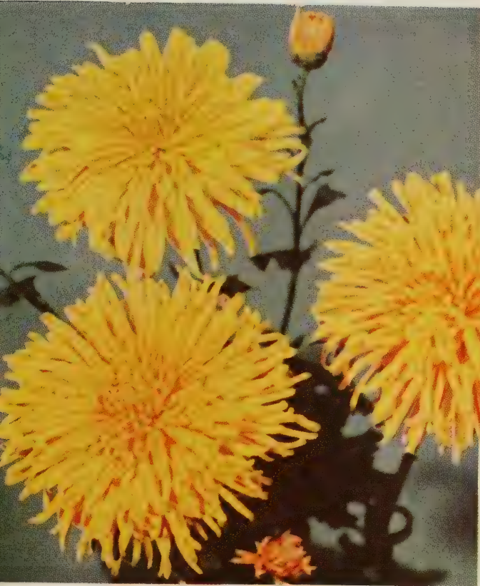
LEE POWELL. 60c each; 3 for $1.50